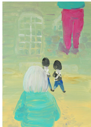
Copenhagen, Denmark, 2021