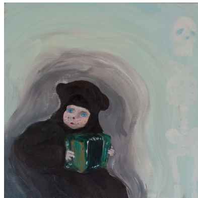
Kaziukas Fair, Lithuania, 2022