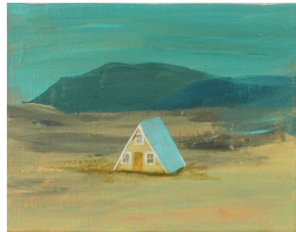
Triangle House, Iceland, 2021