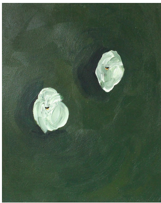
Cranes, Czech Republic, 2021