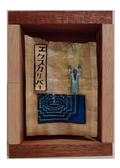
Bob Scheib, Excalibur, mixed media, 16x11.5cm, 2009

Alex Ball, Coral Figure, oil on linen, 12.5x14cm, 2009