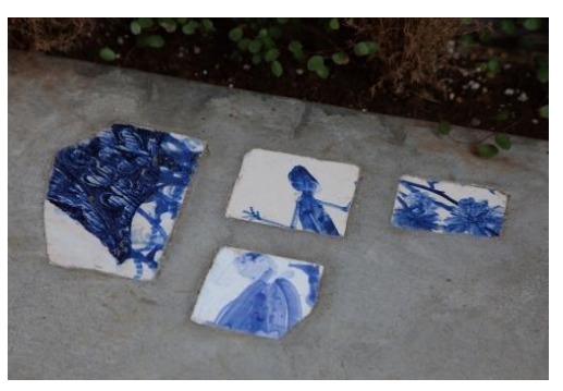
Jun Shirasu, tile works at eitoeiko, 2009

have to call it alternative. eitoeiko is looking for the real alternative, the beauty in the novel pieces.