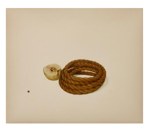
Alex Ball, Arrangement II, oil on panel, 12.5x14.5cm, 2009

the sizes in the pages. These small masterpieces are still brilliant. But the painting of Alex Ball, the actual size looks like the reduced image. The effect tells us what is real in the world. Alex Ball won the Catlin Art Prize in 2008.