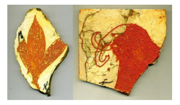
Jun Shirasu, Fish and leaves 13.5x8.2x1.3cm(left), Ancient elephant II, 13x13x1cm(right), stone etching, 2009

eitoeiko is pleased to introduce the group exhibition No More Alternative . The meaning of alternative, is taking the place, something new. It means as same as experimental. Where the NEW comes from? As a contemporary gallery, eitoeiko seeks it from classics. History of beauty is a repetition of affirmative and denial. It changes, but the ultimate beauty is always the same. Only the surface, the expression changes time after time. The new, the new beauty always comes from the past. If only the appearance of something we have not seen look interesting, we do not